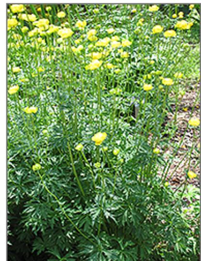
Common Globeflower in bloom