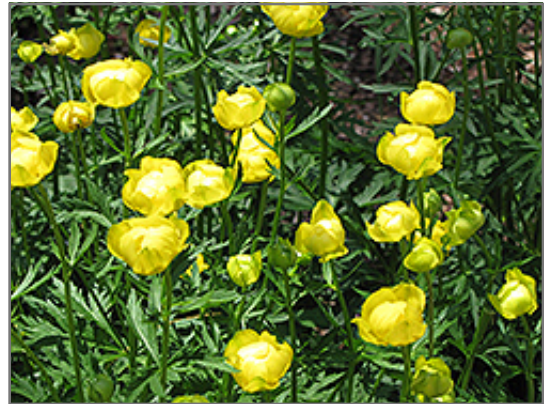
Common Globeflower flowers

Common Globeflower is recommended for the following landscape applications;