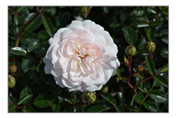
Sea Foam Rose flowers

This shrub will require occasional maintenance and upkeep, and is best pruned in late winter once the threat of extreme cold has passed. It is a good choice for attracting bees to your yard. Gardeners should be aware of the following characteristic(s) that may warrant special consideration;