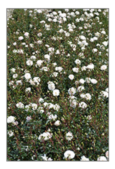
Sea Foam Rose in bloom