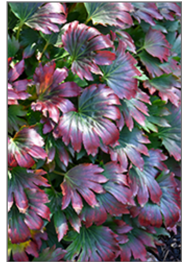
Crimson Fans Mukdenia foliage

Crimson Fans Mukdenia is recommended for the following landscape applications;