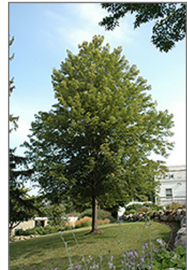
Celebration Maple