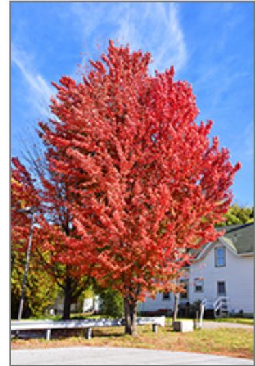
Celebration Maple in fall