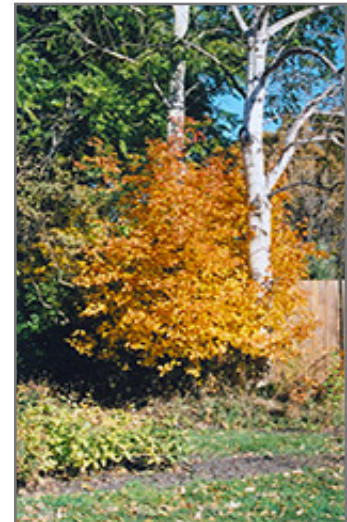
Saskatoon in fall