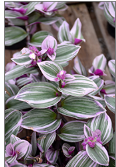
Nanouk Tradescantia foliage

This is an herbaceous evergreen houseplant with a spreading, ground-hugging habit of growth. Its relatively fine texture sets it apart from other indoor plants with less refined foliage. This plant may benefit from an occasional pruning to look its best.