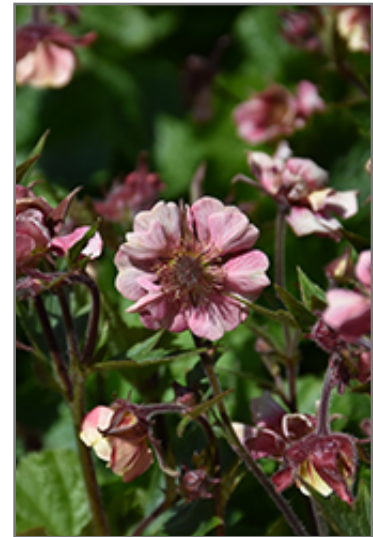
Tempo Rose Avens flowers

Tempo Rose Avens is recommended for the following landscape applications;