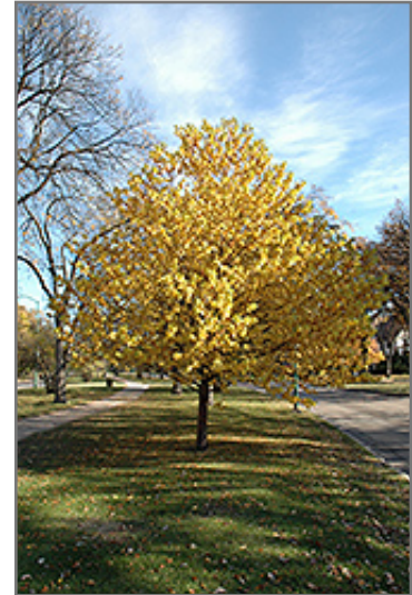
Amur Cherry in fall

This tree should only be grown in full sunlight. It does best in average to evenly moist conditions, but will not tolerate standing water. It is not particular as to soil type or pH. It is somewhat tolerant of urban pollution. This species is not originally from North America.