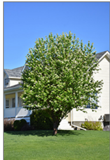
Amur Cherry