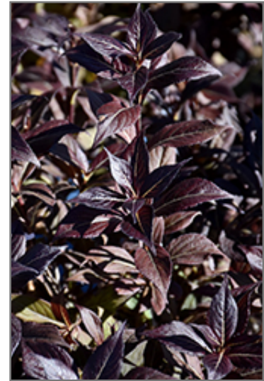
Date Night Stunner Weigela foliage