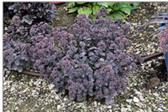
Rock 'N Grow Superstar Stonecrop in bloom