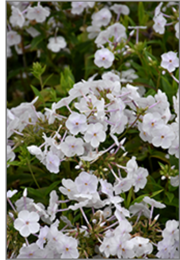
Fashionably Early Crystal Garden Phlox flowers