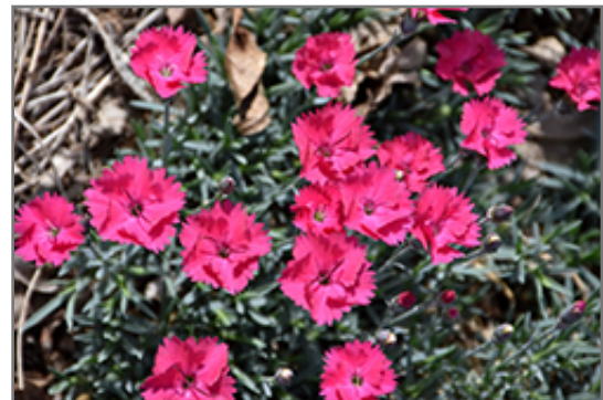
Paint The Town Magenta Pinks flowers