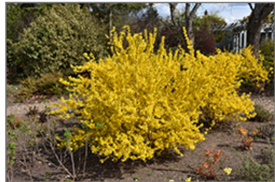
Magical Gold Forsythia in bloom