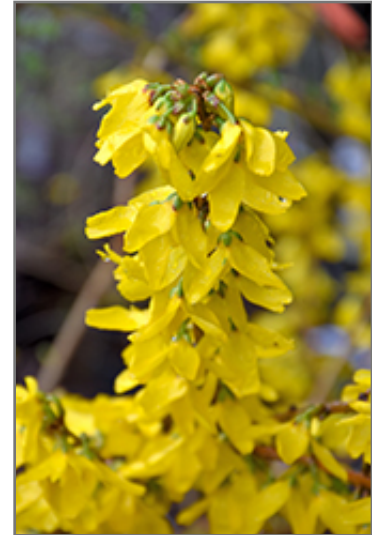
Magical Gold Forsythia flowers

Magical Gold Forsythia makes a fine choice for the outdoor landscape, but it is also well-suited for use in outdoor pots and containers. Because of its height, it is often used as a 'thriller' in the 'spiller-thriller-filler' container combination; plant it near the center of the pot, surrounded by smaller plants and those that spill over the edges. It is even sizeable enough that it can be grown alone in a suitable container. Note that when grown in a container, it may not perform exactly as indicated on the tag - this is to be expected. Also note that when growing plants in outdoor containers and baskets, they may require more frequent waterings than they would in the yard or garden. Be aware that in our climate, most plants cannot be expected to survive the winter if left in containers outdoors, and this plant is no exception. Contact our experts for more information on how to protect it over the winter months.