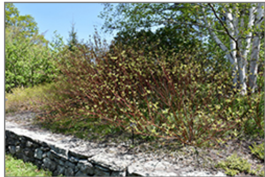
Bailey's Red Twig Dogwood in spring