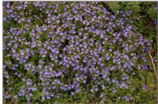
Turkish Speedwell in bloom

Turkish Speedwell is recommended for the following landscape applications;