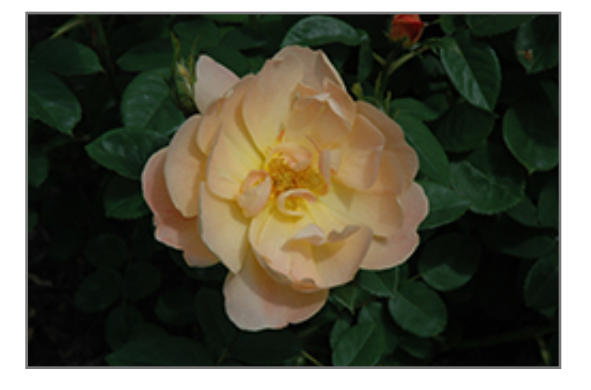
The Lark Ascending Rose flowers