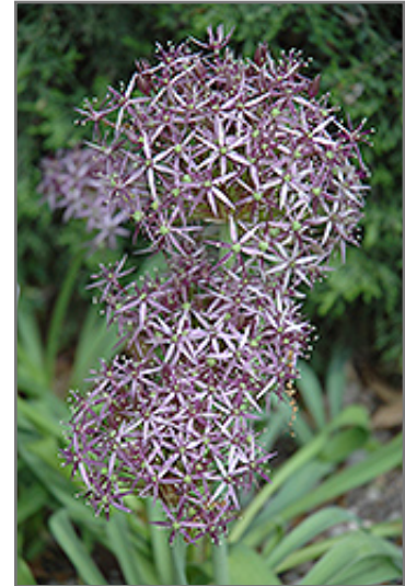
Star Of Persia Onion flowers