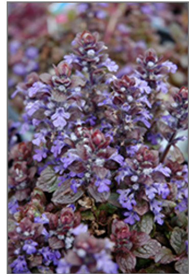
Bronze Beauty Bugleweed flowers

Bronze Beauty Bugleweed is recommended for the following landscape applications;