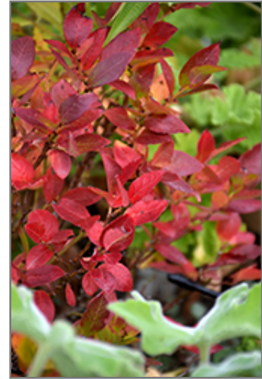
Jelly Bean Blueberry in fall

Jelly Bean Blueberry features dainty clusters of white bell-shaped flowers with shell pink overtones hanging below the branches in mid spring. It has red-variegated green foliage. The glossy oval leaves turn an outstanding red in the fall. It features an abundance of magnificent blue berries in mid summer.