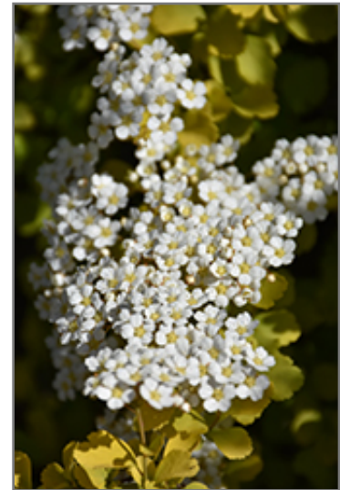
Glow Girl Birch Leaf Spirea flowers