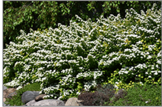
Glow Girl Birch Leaf Spirea in bloom

Glow Girl Birch Leaf Spirea is recommended for the following landscape applications;