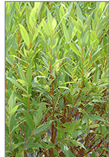
Flame Willow foliage