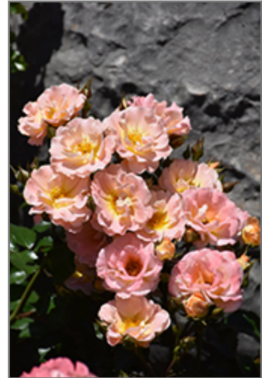
Peach Drift Rose flowers