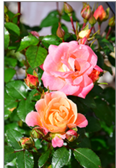
Peach Drift Rose flowers