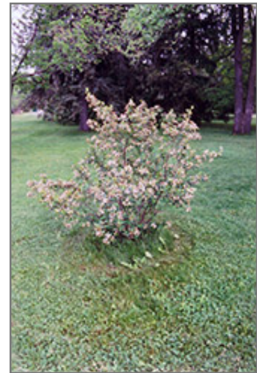
Black Chokeberry in bloom