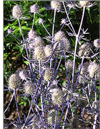
Jade Frost Variegated Sea Holly flowers

Jade Frost Variegated Sea Holly will grow to be about 8 inches tall at maturity extending to 24 inches tall with the flowers, with a spread of 15 inches. When grown in masses or used as a bedding plant, individual plants should be spaced approximately 12 inches apart. Its foliage tends to remain low and dense right to the ground. It grows at a medium rate, and under ideal conditions can be expected to live for approximately 10 years. As an herbaceous perennial, this plant will usually die back to the crown each winter, and will regrow from the base each spring. Be careful not to disturb the crown in late winter when it may not be readily seen!