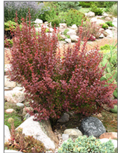
Orange Rocket Japanese Barberry

This shrub does best in full sun to partial shade. It is very adaptable to both dry and moist growing conditions, but will not tolerate any standing water. It is considered to be drought-tolerant, and thus makes an ideal choice for xeriscaping or the moisture-conserving landscape. It is not particular as to soil type or pH, and is able to handle environmental salt. It is highly tolerant of urban pollution and will even thrive in inner city environments. This is a selected variety of a species not originally from North America.