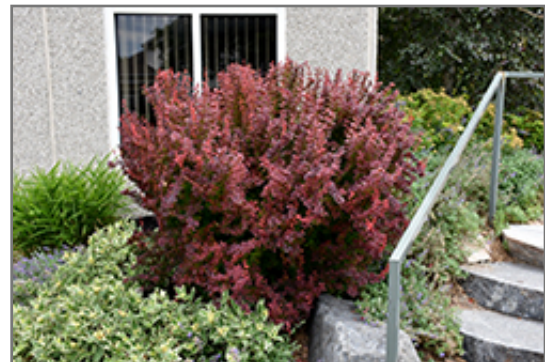
Orange Rocket Japanese Barberry