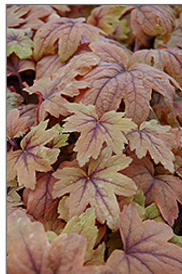
Sweet Tea Foamy Bells foliage