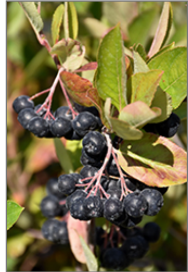
Viking Chokeberry fruit

This shrub should only be grown in full sunlight. It is an amazingly adaptable plant, tolerating both dry conditions and even some standing water. It is not particular as to soil type or pH, and is able to handle environmental salt. It is somewhat tolerant of urban pollution. This particular variety is an interspecific hybrid.