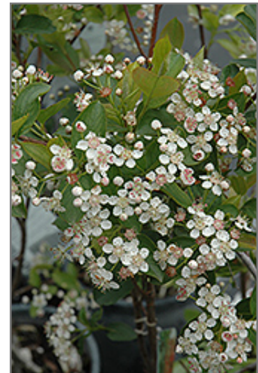
Viking Chokeberry flowers