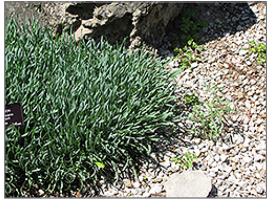
Blue Corkscrew Onion

Blue Corkscrew Onion will grow to be about 12 inches tall at maturity extending to 24 inches tall with the flowers, with a spread of 12 inches. It grows at a medium rate, and under ideal conditions can be expected to live for approximately 5 years. As an herbaceous perennial, this plant will usually die back to the crown each winter, and will regrow from the base each spring. Be careful not to disturb the crown in late winter when it may not be readily seen! As this plant tends to go dormant in summer, it is best interplanted with late-season bloomers to hide the dying foliage.