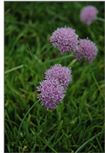
Blue Corkscrew Onion flowers

This is a relatively low maintenance plant, and should only be pruned after flowering to avoid removing any of the current season's flowers. It is a good choice for attracting butterflies to your yard, but is not particularly attractive to deer who tend to leave it alone in favor of tastier treats. It has no significant negative characteristics.