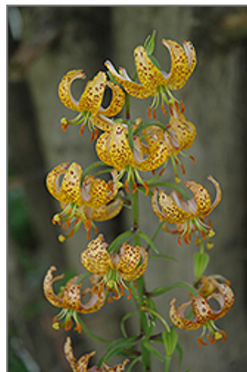
Guinea Gold Martagon Lily flowers