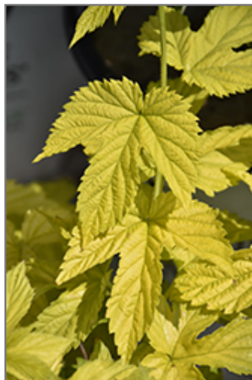
Golden Hops foliage