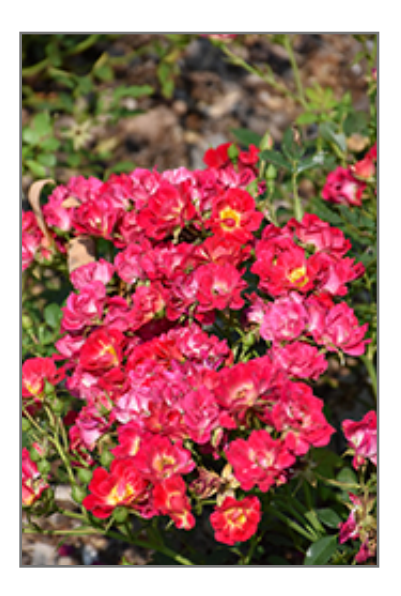
Pink Drift Rose flowers

Pink Drift Rose is recommended for the following landscape applications;