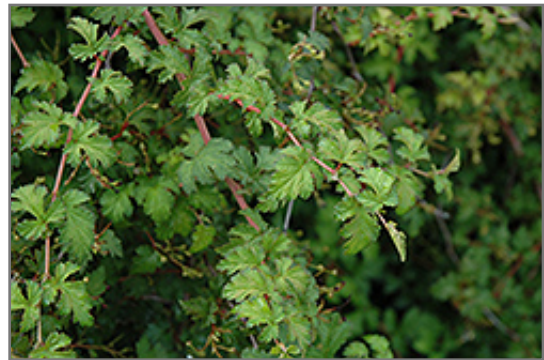
Cutleaf Stephanandra foliage