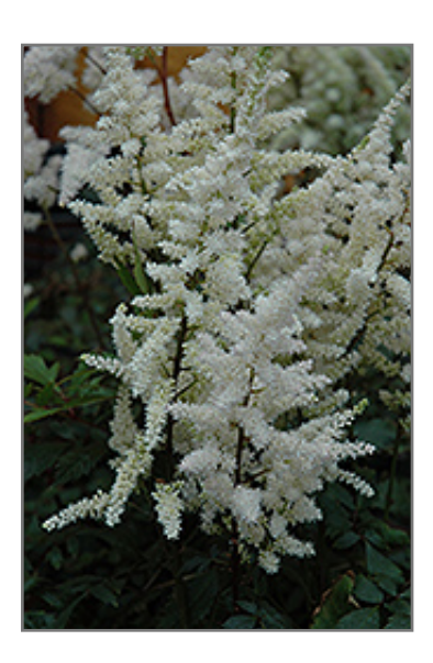
Bumalda Astilbe flowers

Soft, showy, pure white plumes, turn to light pink as they age; flowers rising above glossy leaves; perfect in a shady spot with dappled light; prefers moisture so water regularly for abundant flowers and nice foliage