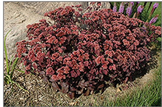
Purple Emperor Stonecrop in bloom