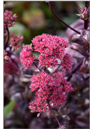
Purple Emperor Stonecrop flowers

This is a relatively low maintenance plant, and is best cleaned up in early spring before it resumes active growth for the season. It is a good choice for attracting bees and butterflies to your yard, but is not particularly attractive to deer who tend to leave it alone in favor of tastier treats. It has no significant negative characteristics.