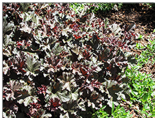
Purple Petticoats Coral Bells