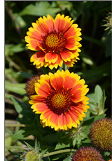
Arizona Sun Blanket Flower flowers

Arizona Sun Blanket Flower is recommended for the following landscape applications;