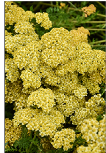
Milly Rock Yellow Terracotta Yarrow flowers