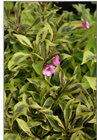
Bubbly Wine Weigela flowers