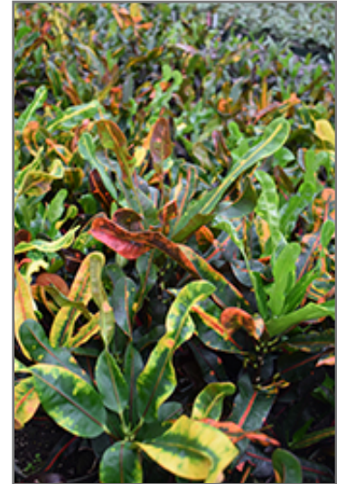
Mammy Croton in full

This is a dense herbaceous evergreen houseplant with an upright spreading habit of growth. Its wonderfully bold, coarse texture is quite ornamental and should be used to full effect. This plant should not require much pruning, except when necessary to keep it looking its best.