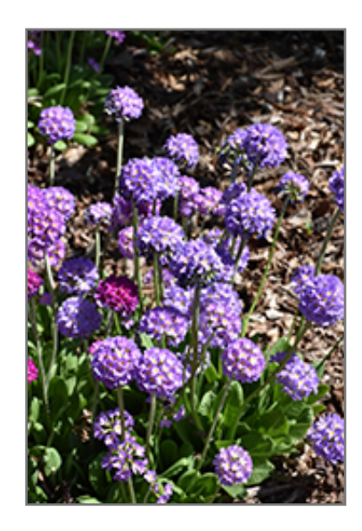
Drumstick Primrose in bloom