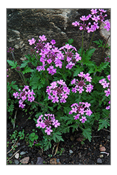
Drumstick Primrose in bloom

This plant does best in partial shade to shade. It does best in average to evenly moist conditions, but will not tolerate standing water. It is not particular as to soil type or pH. It is somewhat tolerant of urban pollution, and will benefit from being planted in a relatively sheltered location. Consider covering it with a thick layer of mulch in winter to protect it in exposed locations or colder microclimates. This species is not originally from North America.