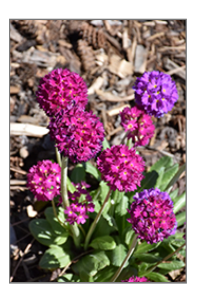
Drumstick Primrose flowers