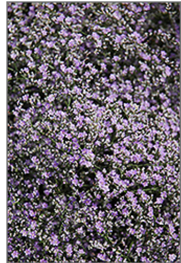
Sea Lavender flowers