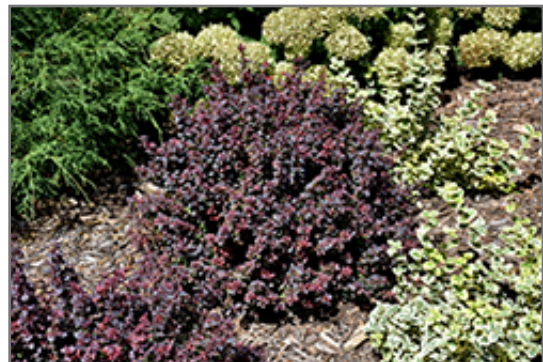
Sunjoy Todo Japanese Barberry