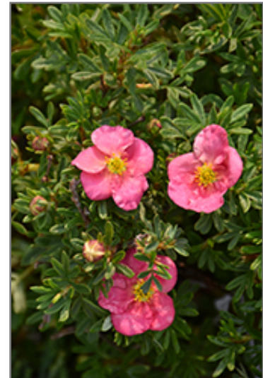
Bella Bellissima Potentilla flowers