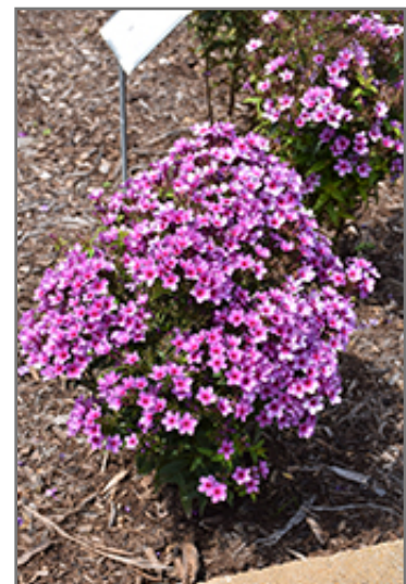
Early Purple Pink Eye Garden Phlox in bloom