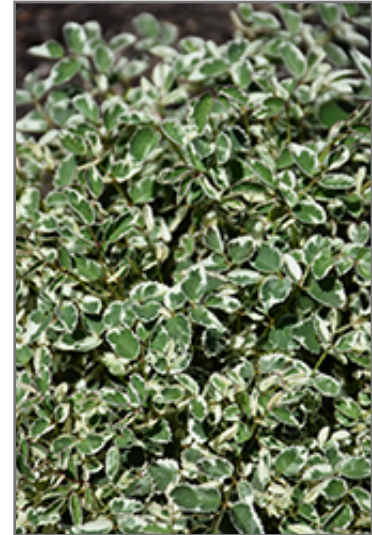
Little Angel Burnet flowers

This plant does best in full sun to partial shade. It prefers to grow in average to moist conditions, and shouldn't be allowed to dry out. It is not particular as to soil type or pH. It is somewhat tolerant of urban pollution. This is a selected variety of a species not originally from North America. It can be propagated by division; however, as a cultivated variety, be aware that it may be subject to certain restrictions or prohibitions on propagation.