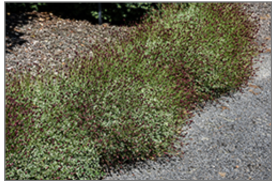
Little Angel Burnet in bloom