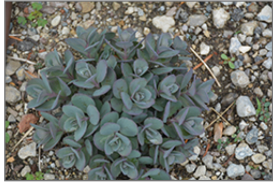
Rock 'N Grow Superstar Stonecrop