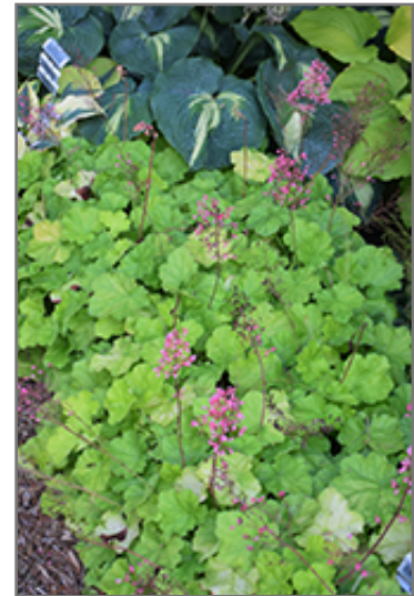
Primo Pretty Pistachio Coral Bells in bloom

This is a relatively low maintenance plant, and should be cut back in late fall in preparation for winter. It is a good choice for attracting butterflies and hummingbirds to your yard. It has no significant negative characteristics.