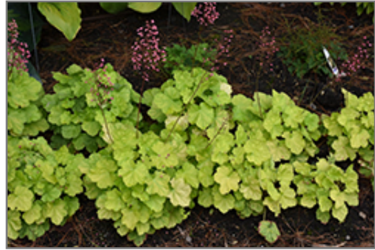
Primo Pretty Pistachio Coral Bells

Primo Pretty Pistachio Coral Bells will grow to be about 10 inches tall at maturity extending to 22 inches tall with the flowers, with a spread of 28 inches. When grown in masses or used as a bedding plant, individual plants should be spaced approximately 26 inches apart. Its foliage tends to remain low and dense right to the ground. It grows at a medium rate, and under ideal conditions can be expected to live for approximately 10 years. As an evergreen perennial, this plant will typically keep its form and foliage year-round.