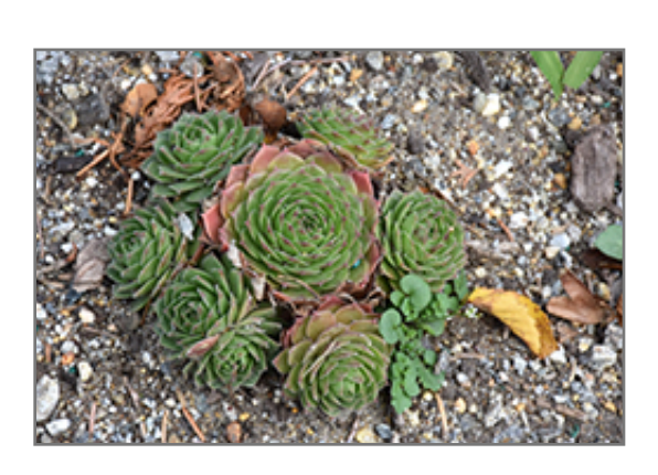
Chick Charms Bing Cherry Hens And Chicks

Chick Charms Bing Cherry Hens And Chicks is recommended for the following landscape applications;