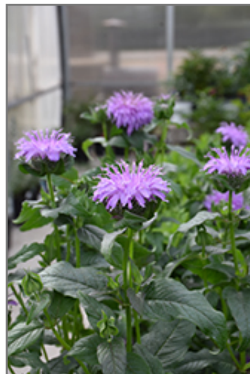
Blue Moon Beebalm flowers