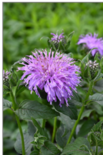
Blue Moon Beebalm flowers