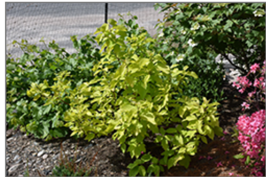
Neon Burst Dogwood